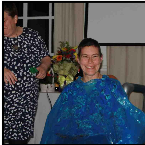
After (plus an appointment at the hairdressers...)